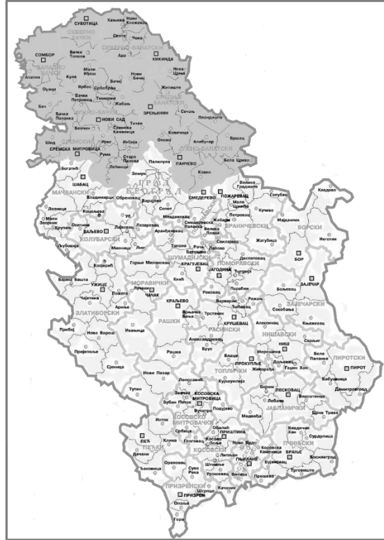
Vojvodina in Serbia