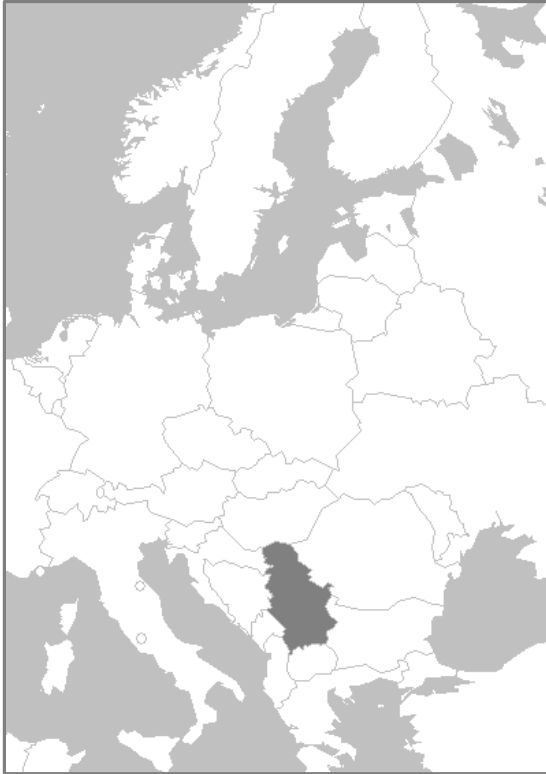
Serbia in Europe